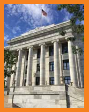
Harvard Medical School

I was moved beyond words when I received the offer to become the inaugural SALG-BIDMC quality and safety fellow. The fellowship is the result of a unique collaboration between the Royal College of Anaesthetists and the Association of Anaesthetists through the Safe Anaesthesia Liaison Group (SALG) and the Beth Israel Deaconess Medical Centre (BIDMC) in Boston, Massachusetts. It is an opportunity that pairs part time clinical work within the department of anaesthesia at the BIDMC with a part time fully funded Master of Healthcare Quality and Safety (MHQS) at Harvard Medical School.